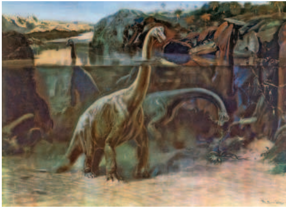
Brachiosaurus. Zdenek Burian (1905–1981).

. . . lay an entire world of streets and people. What sort of world it was now, there was no telling. He could feel them moving there, beyond the walls, almost, like so many chess pieces blown in a dry wind. . . .