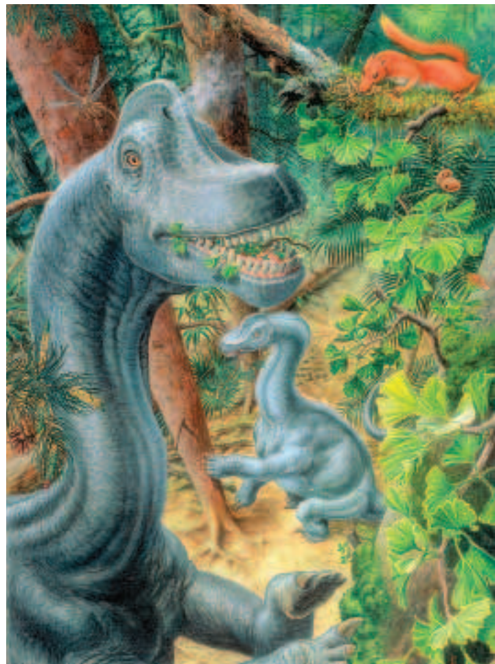
Brachiosaurus . English School, (20th century). Oil on canvas. Natural History Museum, London, UK.

Literary Element Foreshadowing Which of Eckels’s earlier questions foreshadows his action here?