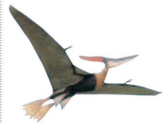
Visual Vocabulary Pterodactyls (ter'ə dak'tilz) are extinct flying reptiles with wingspans of up to forty feet.

The jungle was high and the jungle was broad and the jungle was the entire world forever and forever. Sounds like music and sounds like flying tents filled the sky, and those were pterodactyls soaring with cavernous gray wings, gigantic bats of delirium and night fever.